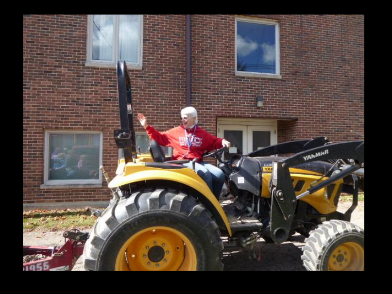
Good bye and thank you to everyone who helped in making a great CSA Fall Festival!