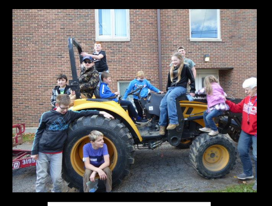
Everyone wanted to get on the tractor!