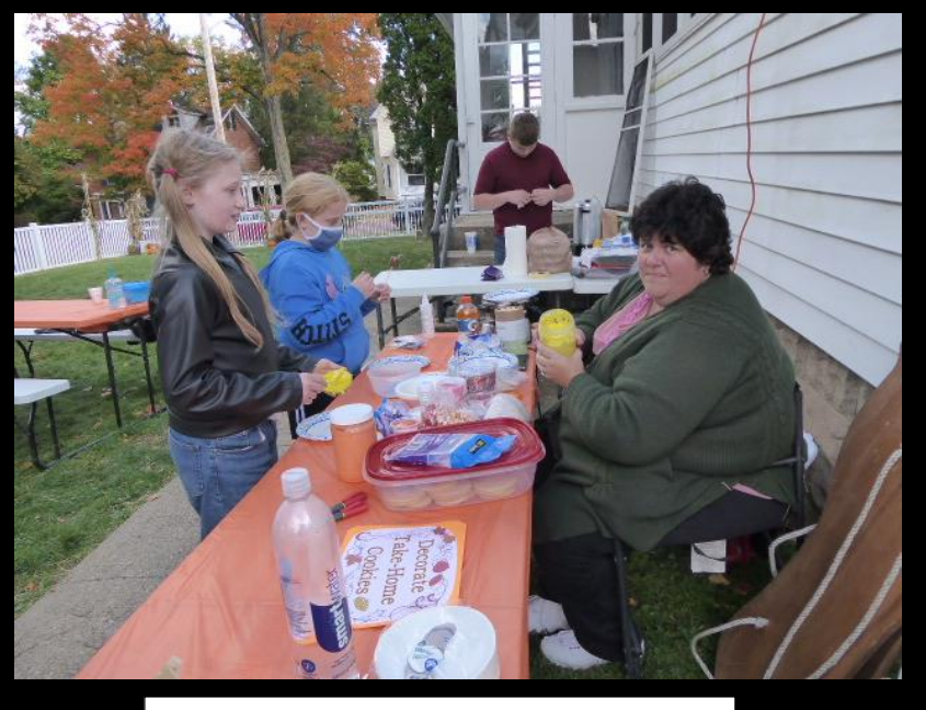
Cookie & treat making station!