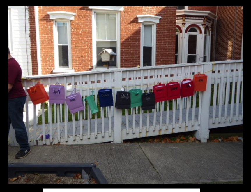
Ticket and prize holding bags