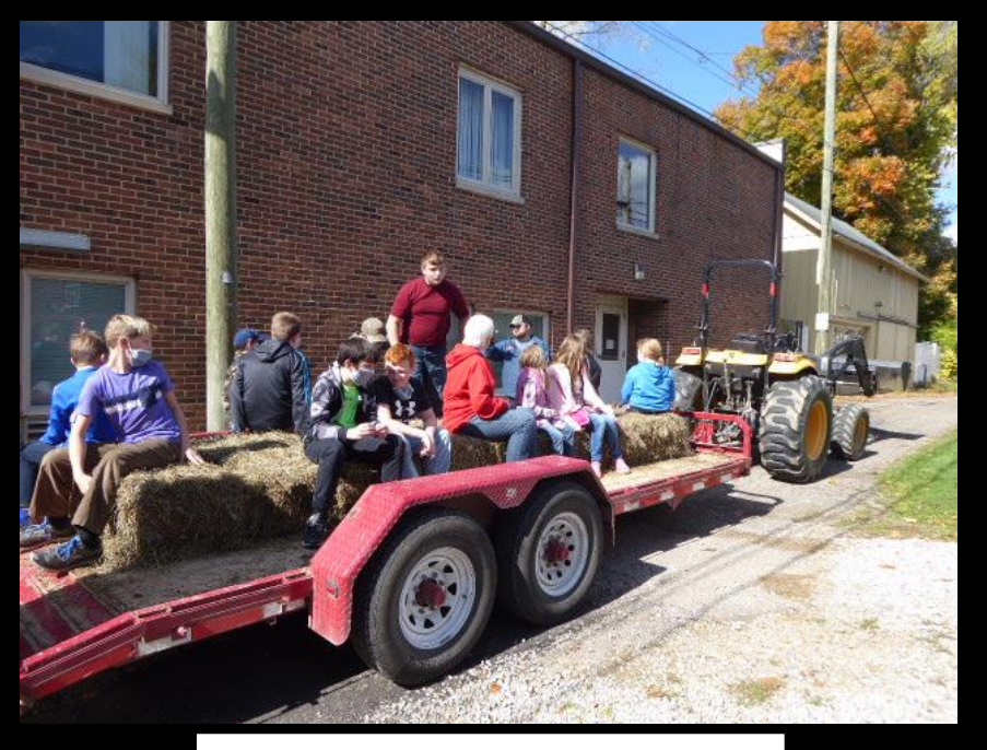
Everyone finding their spot to sit.