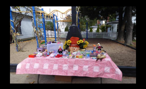
The Prize Table!

Students were awarded tickets for working hard and obeying CSA's rules.