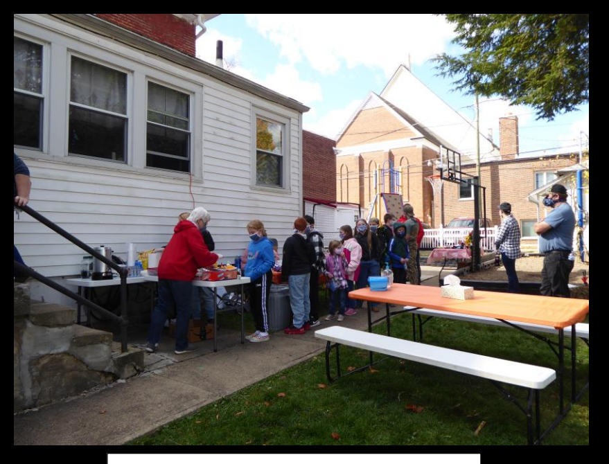
Lunch: grilled hot dogs and more!