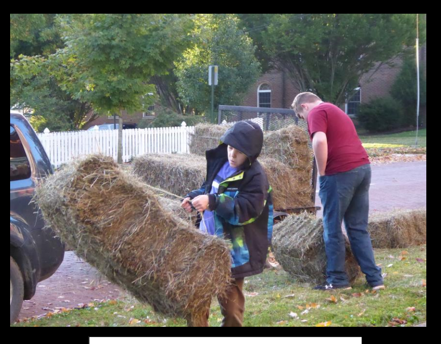
The set up begins!