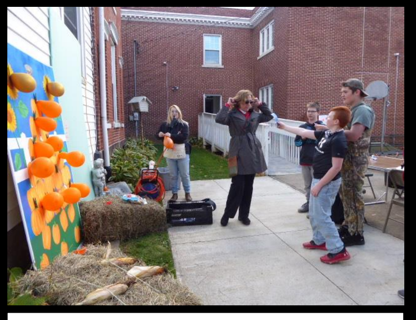
We couldn't have done this without lots of adult help!