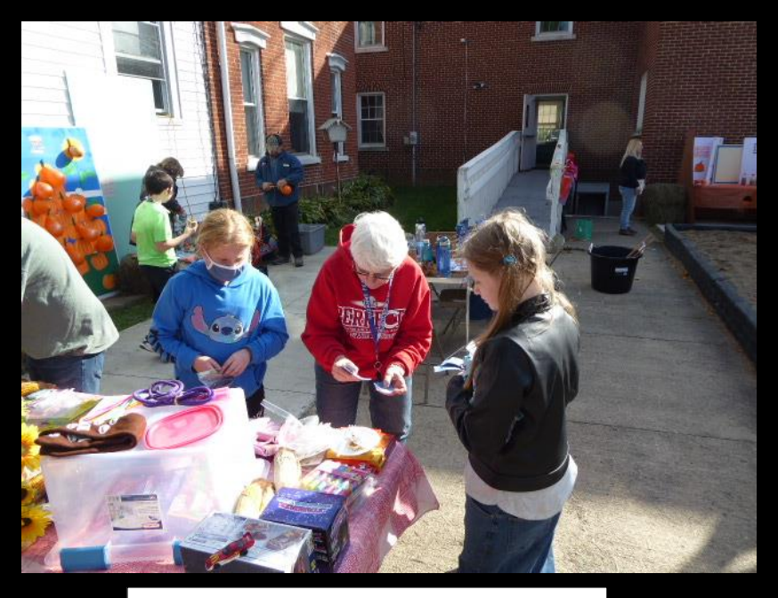
Time to cash in some tickets.