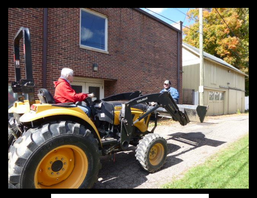
Just for fun!